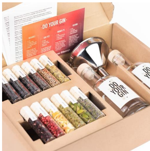
DIY Gin-Making Alcohol Infusion-Kit $47.92 At Amazon

Now here's a DIY project you'll actually want to help with! The DIY Gin-Making Alcohol Infusion-Kit is perfect for couples looking to mix things up and have a good time in the process. The kit comes with everything you need to make three bottles of small-batch, craft gin at home. And because it is packaged with 12 exotic botanicals sourced from all over the world, including Juniper-berries, pink-pepper, lavender, cardamom, cubeb and many more, each batch is your own unique creation! Plus, the products are made in America with 100 percent organic, recyclable, biodegradable materials making in Earth friendly. I'd say that's a win-win!