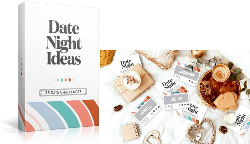
Date Night Box $18.00 Available At Amazon

Whether it's been 20 years or 20 days, picking the perfect date can often be a couple's biggest challenge. But now, thanks to this ingenious set of scratch-off, date night cards, you'll never suffer a dull evening again. Featuring 35 fun and exciting date "challenges," the object of the game is simple – you must complete the date challenge, no matter! There are no "take backs" which is why each card includes helpful symbols to help you better understand whether the dates will take place at home, indoors, away from home and even if you need a babysitter (if you have kids or fur babies).