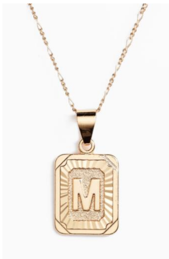
Bracha Initial Pendant Necklace $50 At Nordstrom

Personalize your gift with this elegant initial pendant necklace from Bracha. Hand-crafted in the U.S., the necklace is 14K gold plate and the pendant is 14K gold fill making it a truly luxe-looking piece. Perfect for day to night, she'll never take this off and it will serve as a constant reminder of your love and affection.